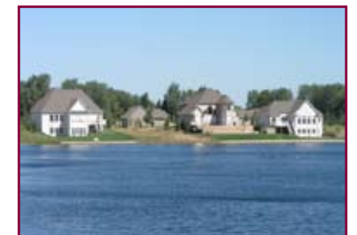
(Photos depict similar view of Lake Blackthorn)